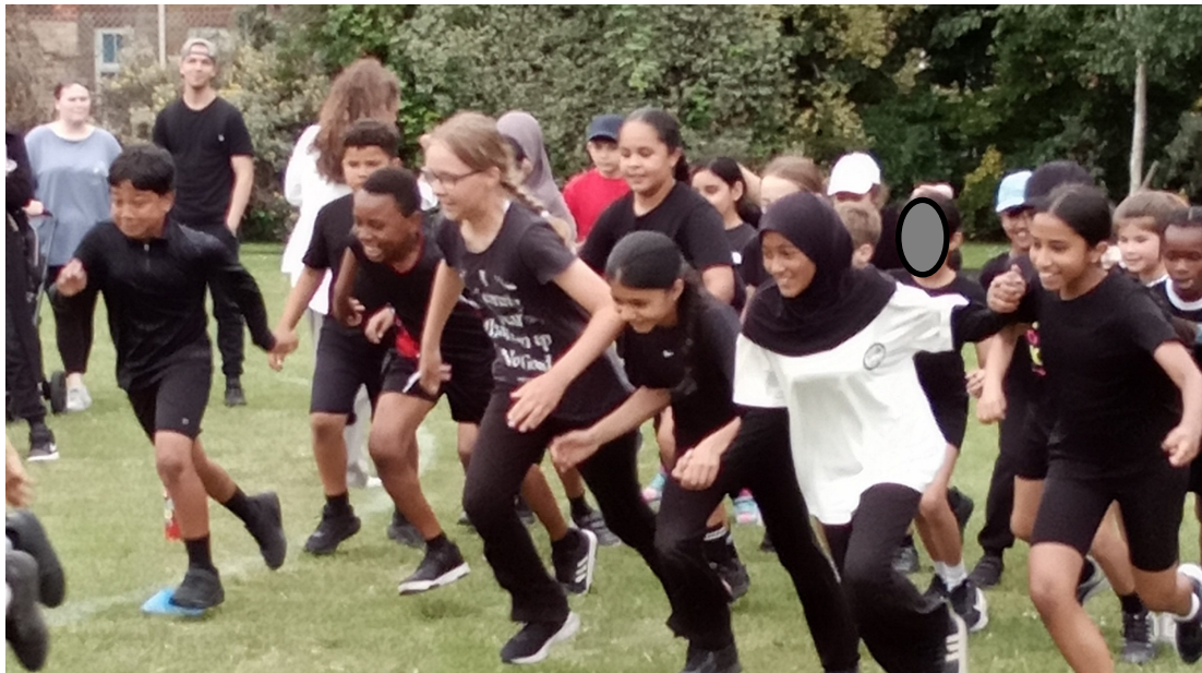
Winners, Syon House doing a lap of honour

What a wonderful day we had for our 2026 Sports Day! Both Key Stage One and Key Stage Two events were a tremendous success, filled with excitement, teamwork and determination.