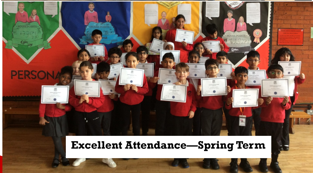
Excellent Attendance—Spring Term