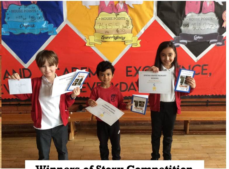
Winners of Story Competition