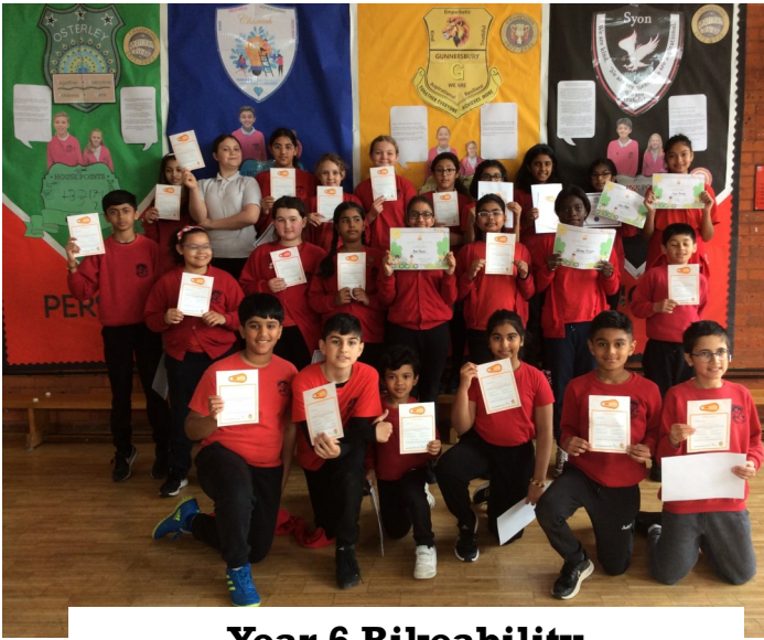
Year 6 Bikeability