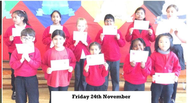
Friday 24th November