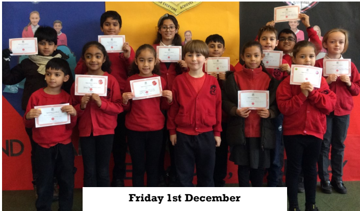
Friday 1st December