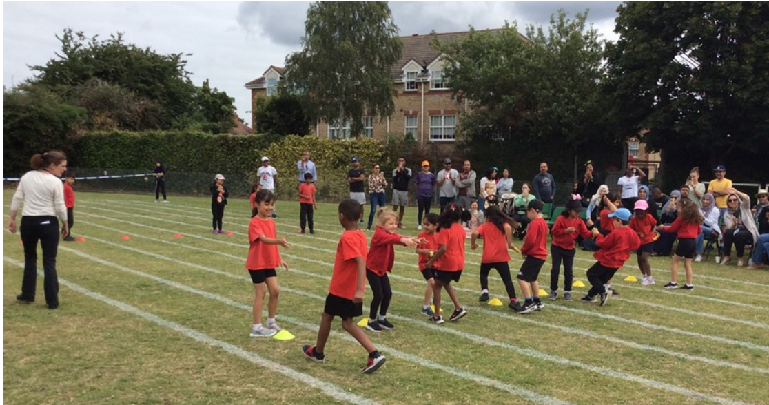
Sports Day 2023

It is always lovely to hear about the interests that many of our children have outside of school. There have been some recent successes that we would like to share with you. Well done to all of the pupils on these accolades.