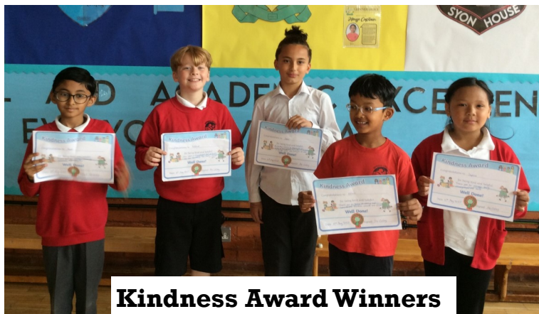
Kindness Award Winners