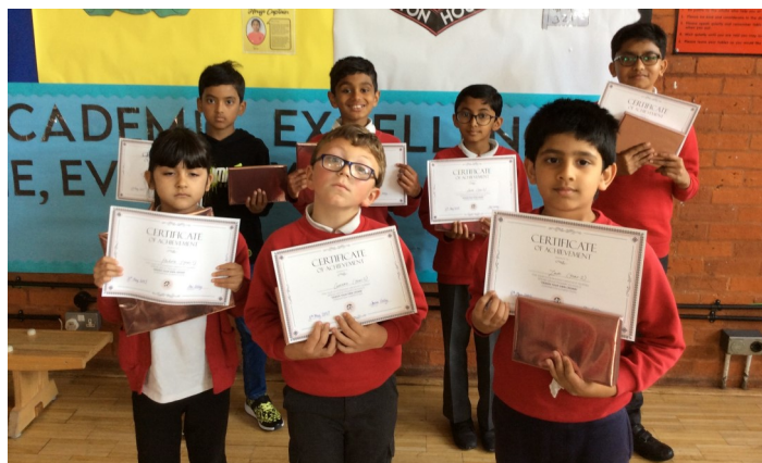
Winners of the Design a Crown Competition

An email from FOSGS was sent yesterday to all parents encouraging attendance at the meeting happening on Wednesday 24th May from 3.30pm in the school hall. Please attend if you are able to.