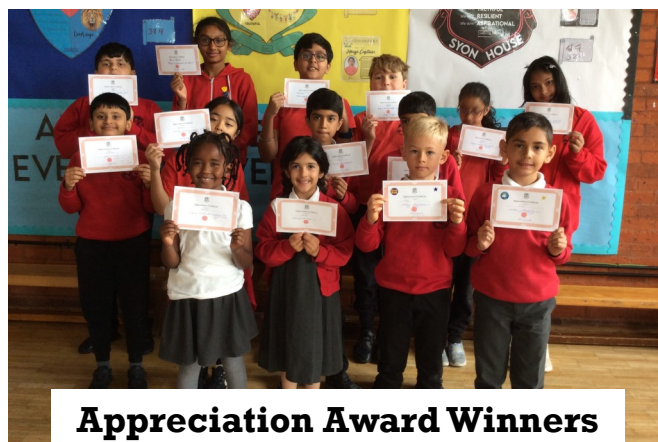
Appreciation Award Winners

Life at Spring Grove has been even busier than usual this half term as we have had to administer the national SATs papers for KS1 and KS2 . We have been very proud by the attitude, focus and determination of all the children to do their personal best.