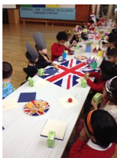
Our street party celebration

We held our own Coronation where two children were crowned King and Queen of Nursery. We paraded, we crowned and we celebrated with our own 'street party'! We then learnt about the King's values and what he wants for the world. We learnt about recycling and looking after the natural world. We have made pledges of what we will do to help the world be a better place for everyone.