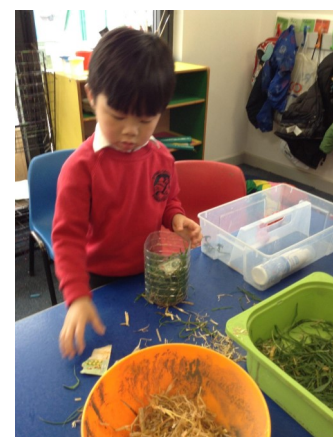
Making a home for worms!