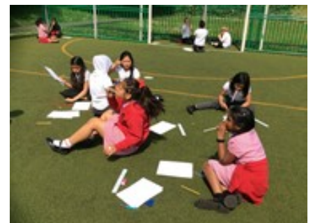
Photo and news about Thames Young Mariners >>> PTO