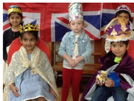
The King and Queen after the coronation

We held our own Coronation where two children were crowned King and Queen of Nursery. We paraded, we crowned and we celebrated with our own 'street party'! We then learnt about the King's values and what he wants for the world. We learnt about recycling and looking after the natural world. We have made pledges of what we will do to help the world be a better place for everyone.