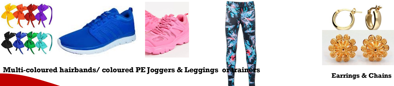
Multi-coloured hairbands/ coloured PE Joggers & Leggings or trainers

Following items are not part of our uniform and should not be worn to school