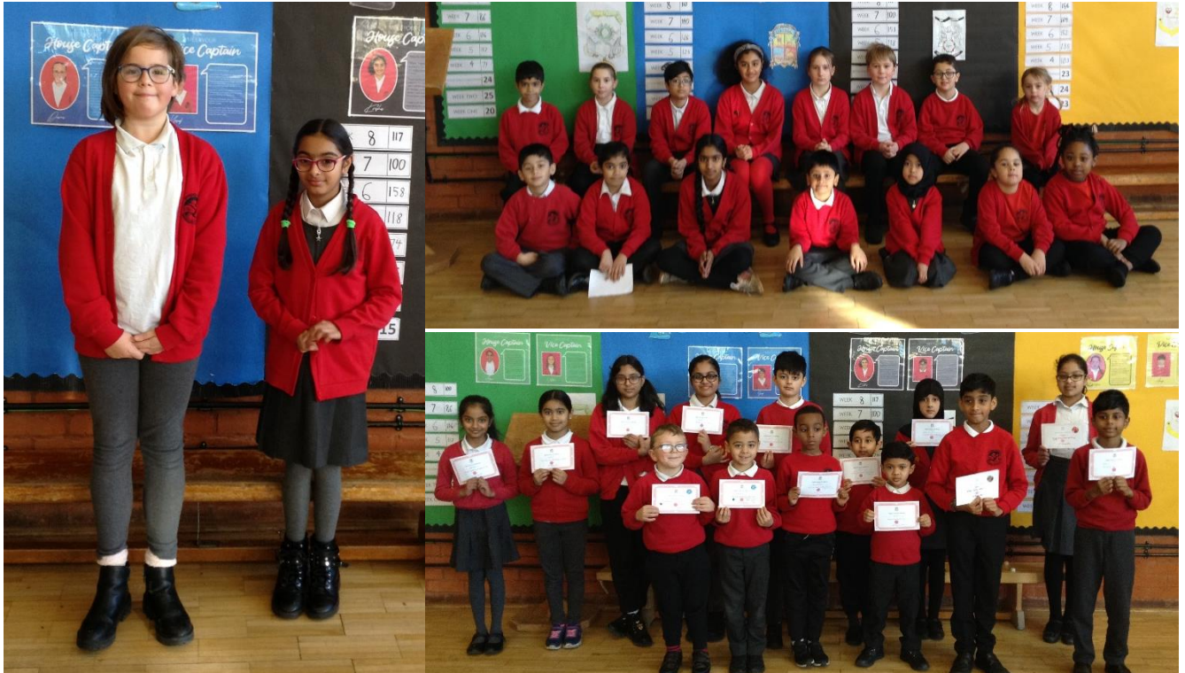
Appreciation Assembly Winners 7 th January (top) & 15 th January (bottom) Winners of Golden Lock (left)