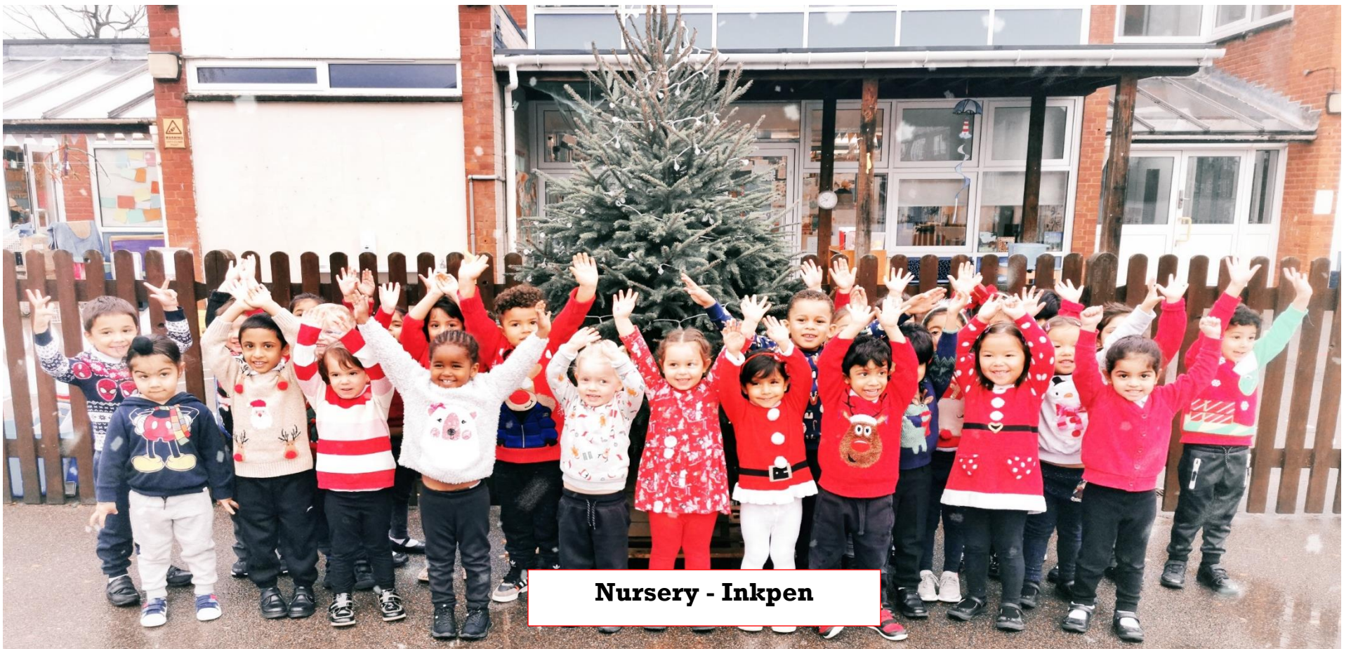
Nursery - Inkpen

Festive Greetings to all our families!!!