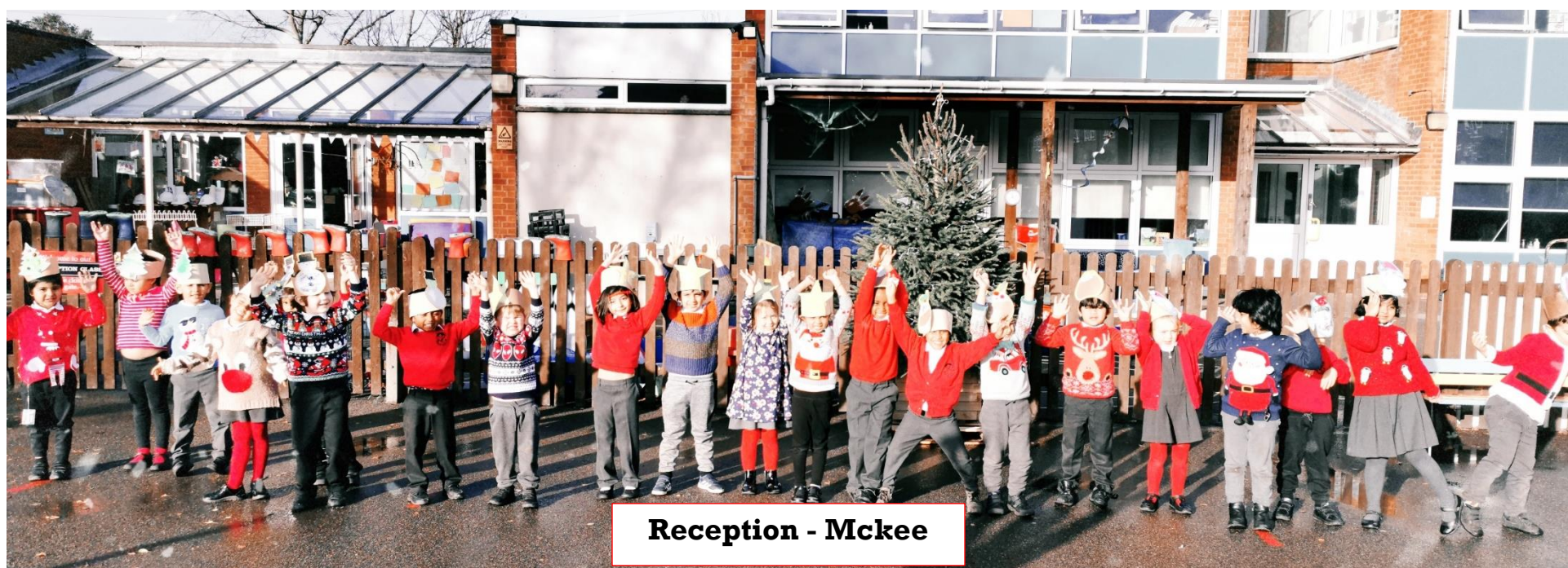
Reception - Mckee