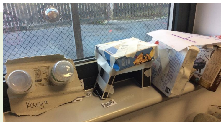
Inkpen Safe Towers

Year 5 were very enthusiastic about their project; they have created mood boards to help with their fruit and vegetable bunting designs. Look out for it near the school garden when it is completed!