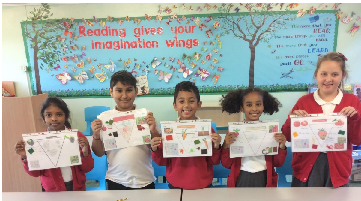
D&T Week - Mood Boards by Year 5 Rundell